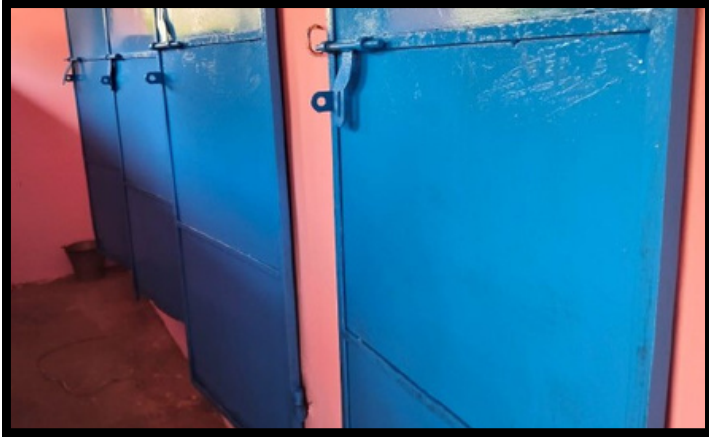
Painting and restoration of toilets