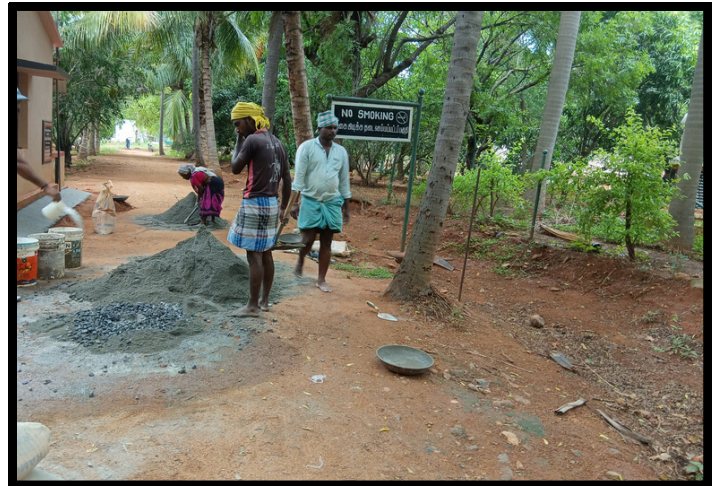
Cementing Broken Areas