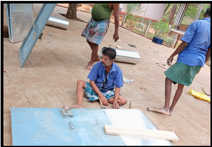
Reworking and realigning damaged doors