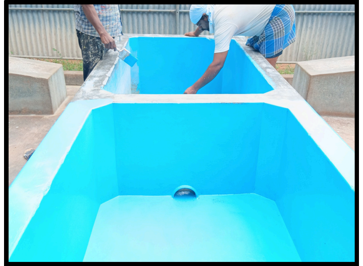
Deep cleaning of water tanks