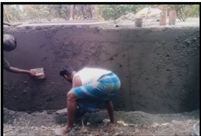
Septic tank maintenance and treatment