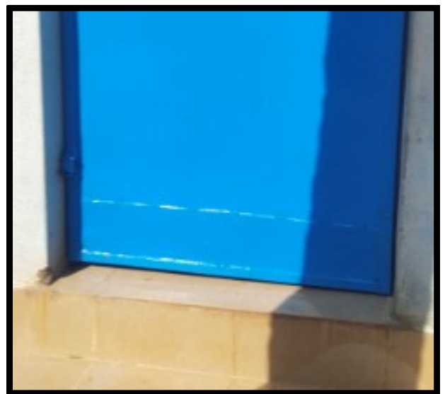
Fixing of new doors in dormitories