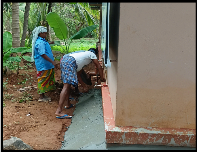
Cementing the side surfaces around the home