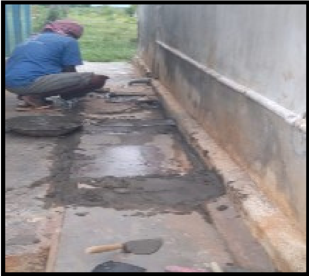
Repairing damaged pathway