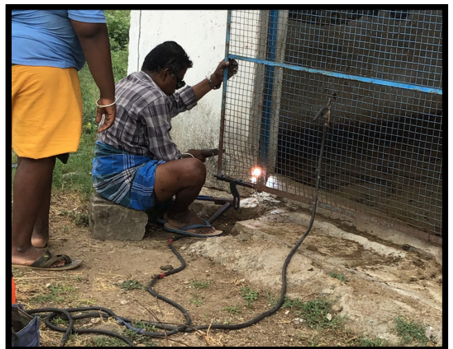
Repair and strengthening of the goat stable