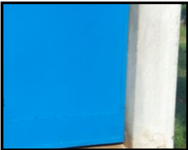
Installation of new doors for increased accessibility