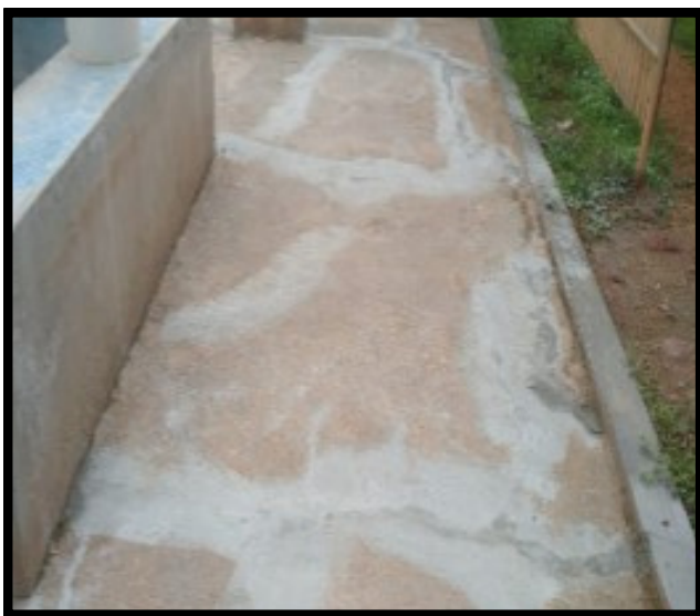
Cementing work on broken floor areas