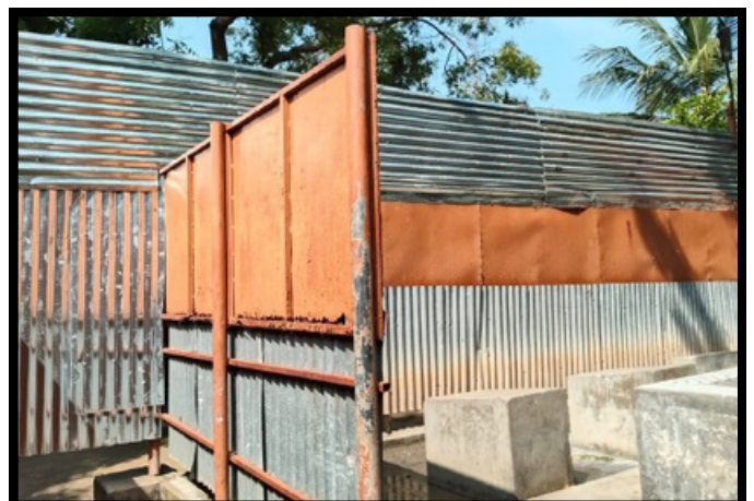
Modifications in children's bathing area for safety