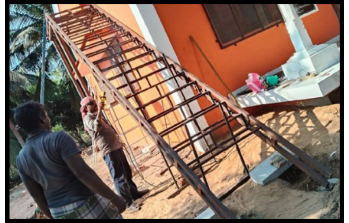
Staircase and attic work for the newly built cottage