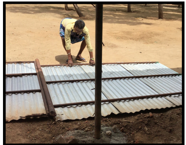
Roofing work for toilets