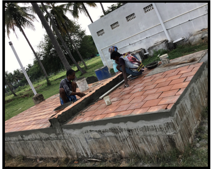
Septic tank maintenance and cleaning